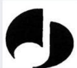
Yamaha Grand Pianos

MORGENROTH MUSIC CENTERS 1105 W Sussex, Missoula, MT 59801 800-462-0013 www.montanamusic.com