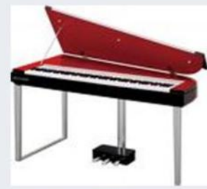
Yamaha Digital Pianos